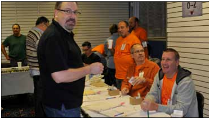
Lots of action in the registration checkin room.