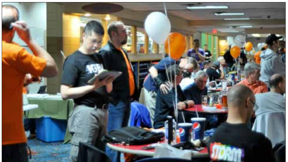
Bowlers milling about during the Friday night team shift at AMF Annandale Lanes.